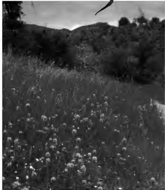
Owl's clover on Mill Creek off old Kern Canyon Road.